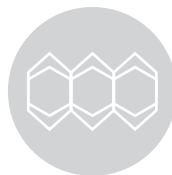
Cell in Cell