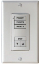
6 Button – DecoFlex Digital Keypad