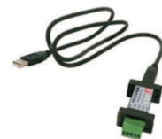
USB to RS485 Adapter Kit (PC Connection)