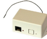
RTS Receiver for Stand-alone SDN