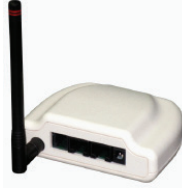
Universal RTS 16 Channel Interface