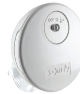
Thermo Sunis RTS Sun Sensor