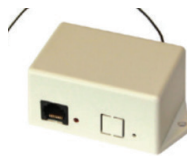
IGC RTS Receiver Missing info for 1811492