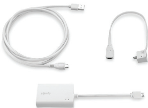
TaHoma Switch Ethernet Adapter