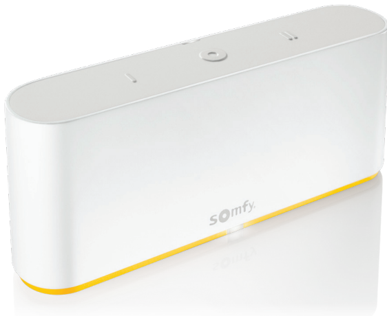
TaHoma Switch (Zigbee & RTS Controller)

TaHoma RTS Smartphone and Tablet Interface Order Code: TZSH