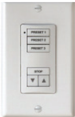
DecoFlex Dry Contact Keypad (3 intermediate positions)