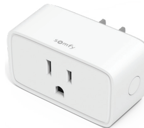
Smart Plug – Zigbee (Repeater)