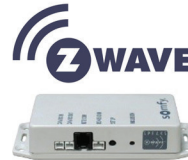
ZDMI – Z-Wave® to Digital Motor Interface