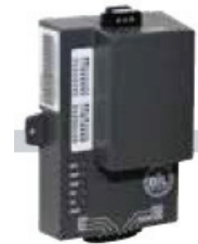
Somfy Connect™ BMS Interface