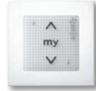
Smoove 1/4 RTS Wall Switch