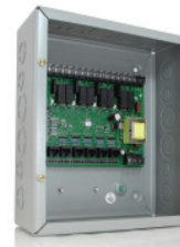
Individual-Group Control (IGC/4N1)