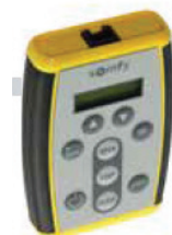
RS485 Limit Setting Tool (Handheld)