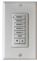
8 Button – DecoFlex Digital Keypad