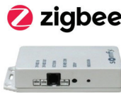
ZbDMI — ZigBee™ to Digital Motor Interface