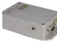
Somfy Connect™ LTI