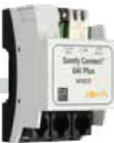
Somfy Connect™ UAI Plus